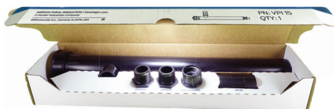
Shown above: Components per box.

While not mandatory, Teflon tape can be used on the fittings during assembly for added security. Avoid using pipe dope. You can connect the VPI to the span through any outlet you choose for optimal visibility. Install a 3/4" NPT threaded tee fitting between the span outlet and gooseneck or sprinkler. Then, use a longer 3/4" NPT nipple to position the indicator according to your preferences and mainline diameter.