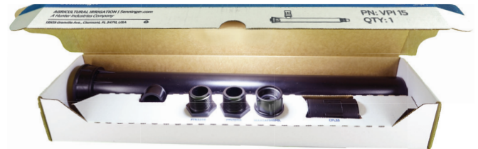
Shown above: Components per box.