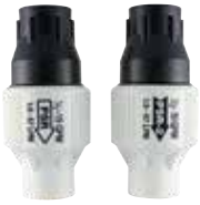
PSR & PSR-2