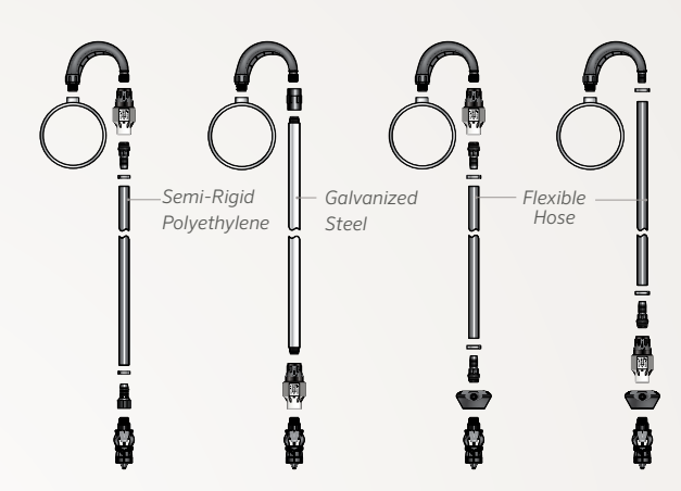
Minimum ground clearance of 3.0 ft (0.91 m)