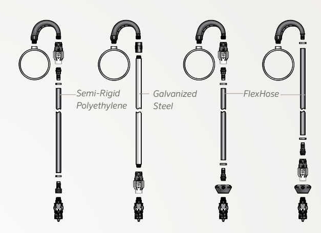
Minimum ground clearance of 3.0 ft (0.91 m)