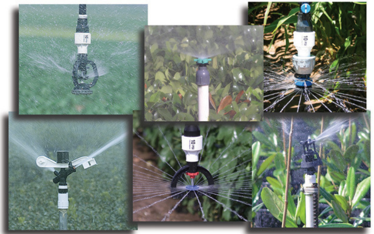
Senninger products are used in agriculture, nurseries, land application of effluent solutions, and leaching of copper and gold mining solutions

LOYALTY ... “You don’t earn loyalty in a day. You earn loyalty day-by-day.”