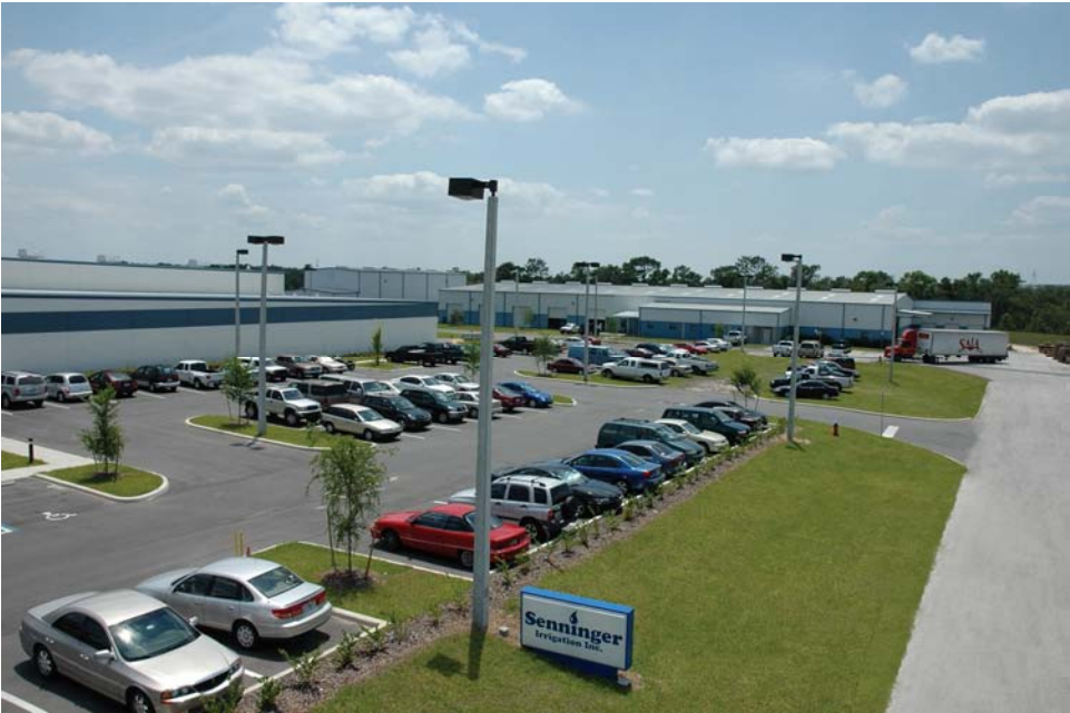
The Senninger corporate headquarters is located in Clermont, Florida.

If you are interested in joining a team like this or would like more information about Senninger Irrigation, call 407-877-5655.