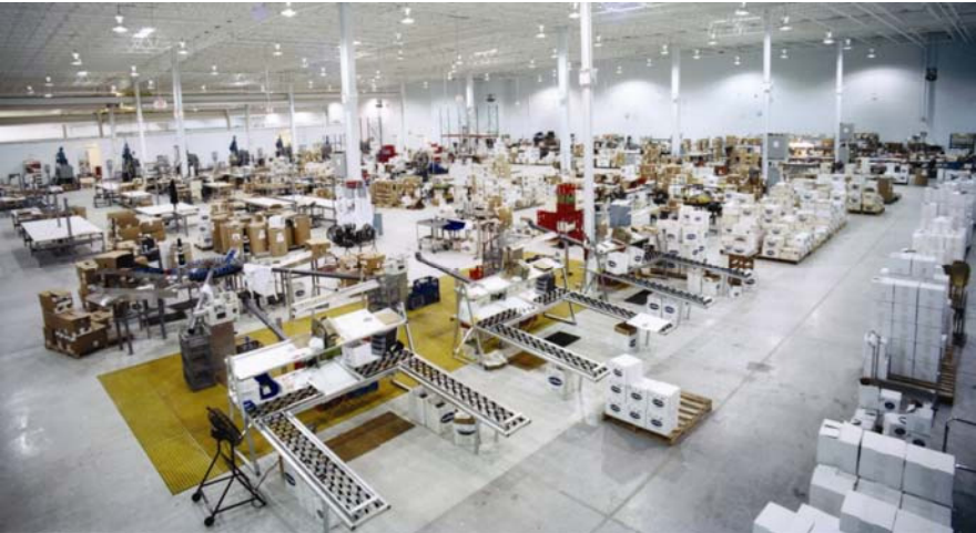
Senninger runs three shifts 24-hours a day. View overlooking the production area.

TEAMWORK ... “We are committed to working together, each part a sum of the whole, all contributing to the final outcome and that outcome is success.”