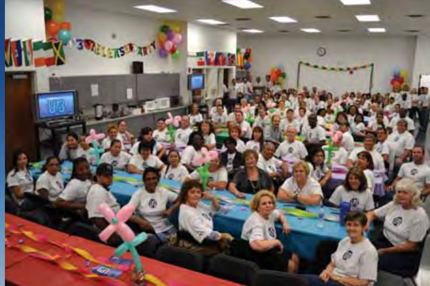
Senninger hosts UP3 product release party for employees. Without each of them this would not be possible.

Senninger brings you our UP3 (Universal Pivot Products Platform). The new features of this design have been applied to the proven technologies of the i-Wob, Xi-Wob, LDN, and soon the Super Spray. This new nozzle concept will provide the mechanized irrigation market with tremendous benefits in applications of water and system operation.