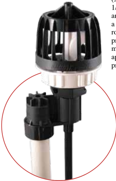
HA 23° model

The Senninger Riser Adapter (shown with Smooth Drive) has a 1/2" F NPT sprinkler connection and can be mounted securely on a 1/2" or 3/4" PVC or 5/16" steel rod stake and connected to low pressure polyethylene laterals, making it well suited for portable applications such as vegetable production.