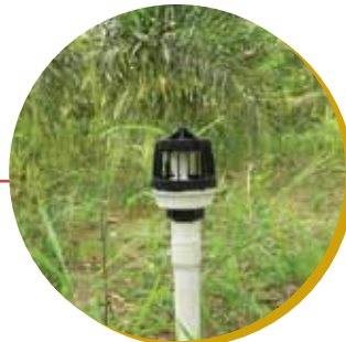
HA 23° model