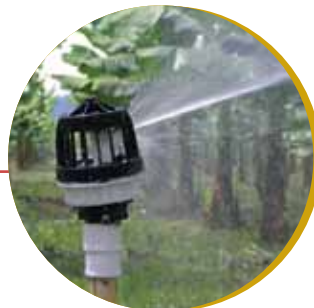
LA 14° model