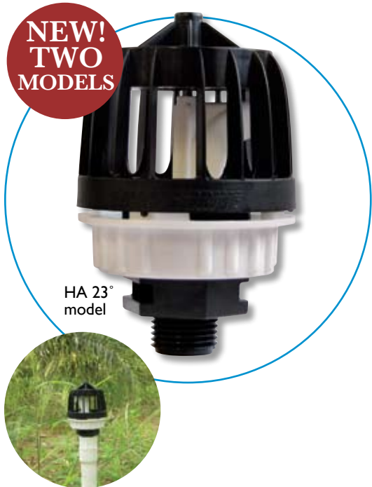
HA 23° model

Senninger's new Smooth Drive is designed for under-tree, open-field and nursery irrigation. Its unique "walking diffuser" helps deliver an extremely uniform pattern, without distortion from bracket legs.